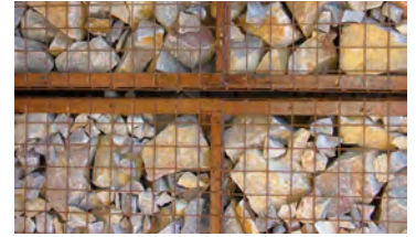
GABION BASKET CHARACTER IMAGES