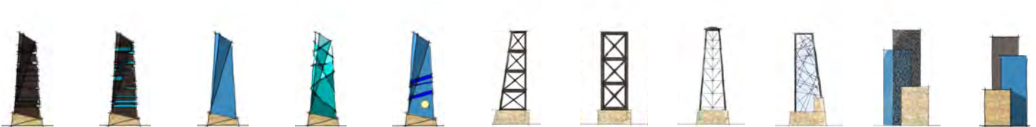
PALETTE OF ICON & THEMATIC ELEMENT