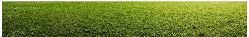
ARTIFICIAL TURF CHARACTER IMAGE