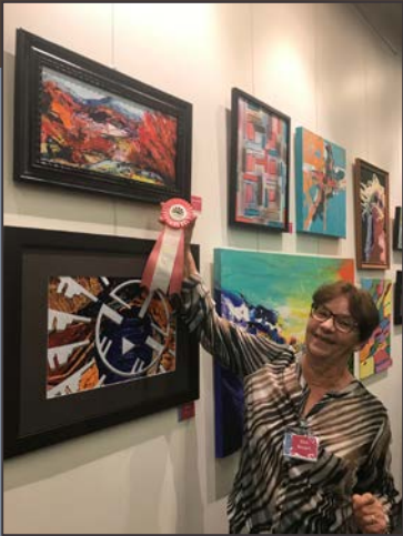
Goodyear Branch Library Fine Art Exhibits