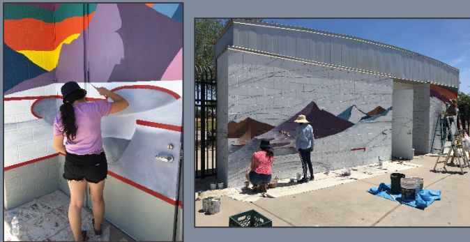
Mural Mentoring Teens 2019: Goodyear Skate Park