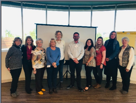
Commission Retreat 2020