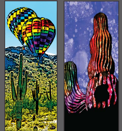
Public Art Light Pole Banners Installed May 2020