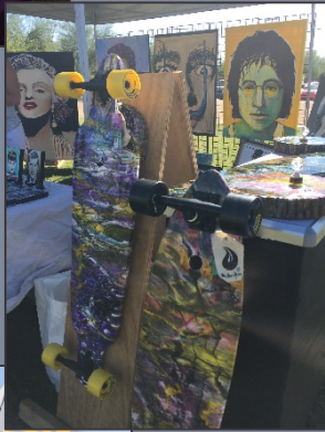
Deliver New Arts Experiences