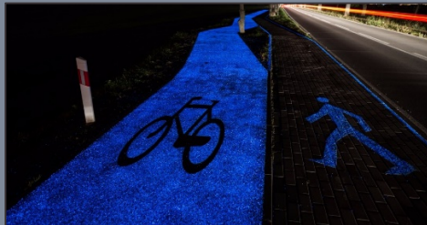
Illumination: Art in the Park After Dark