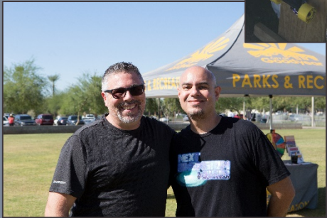
Connect Local Artists