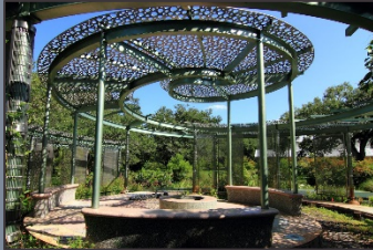
Conceptual Public Art: Shade Structure