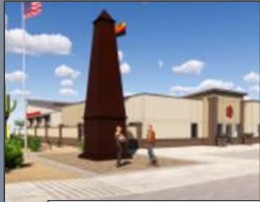
Fire Station 181 Memorial Artwork