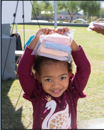
Art in the Park