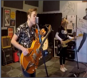
Chalk on the Walk