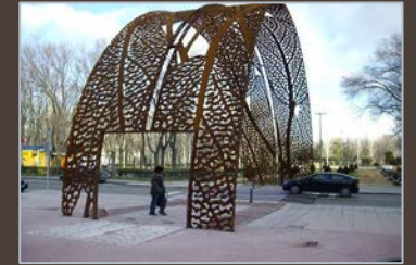
Public Art Archway