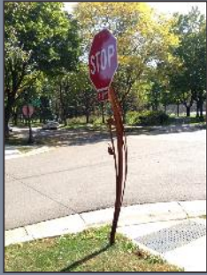
Conceptual Public Art: Stop Sign