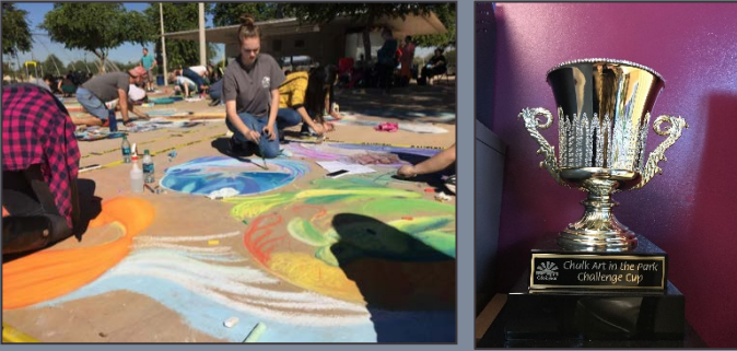
High School Challenge: Chalk Art in the Park 2019