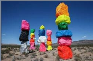
Conceptual Destination Public Art: Seven Magic Mountains