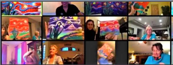
Live Paint Parties