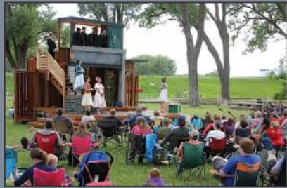
Community Theater: Shakespeare in the Park