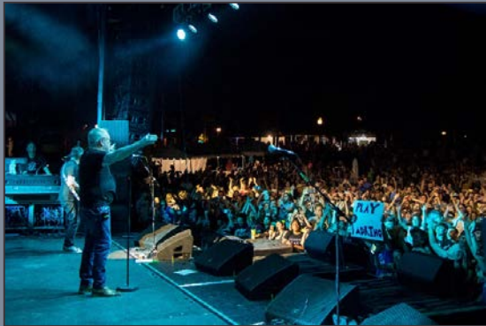
2019 Goodyear Lakeside Music Fest