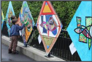
Conceptual Community Building Public Art