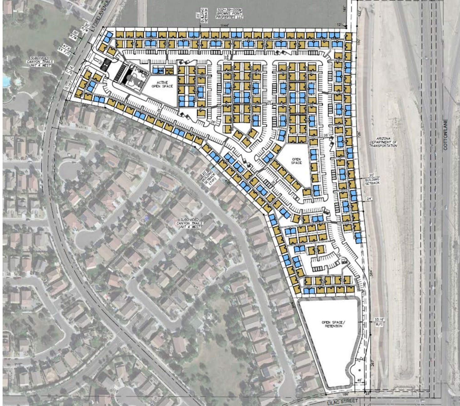
Canyon Trails South Site Plan