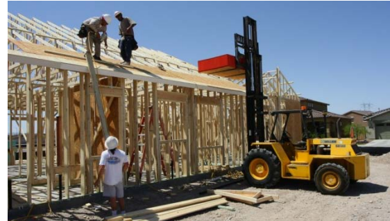
Figure 5.6 Construction of a new home

Objective GD-2-2. Focus new growth in the City’s designated growth areas to effectively utilize resources, minimize operation and maintenance costs, and attract and efficiently provide new services such as transit and entertainment opportunities.