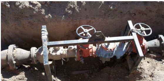
Figure 5.5 Waterline replacement

Objective GD-2-2. Focus new growth in the City’s designated growth areas to effectively utilize resources, minimize operation and maintenance costs, and attract and efficiently provide new services such as transit and entertainment opportunities.