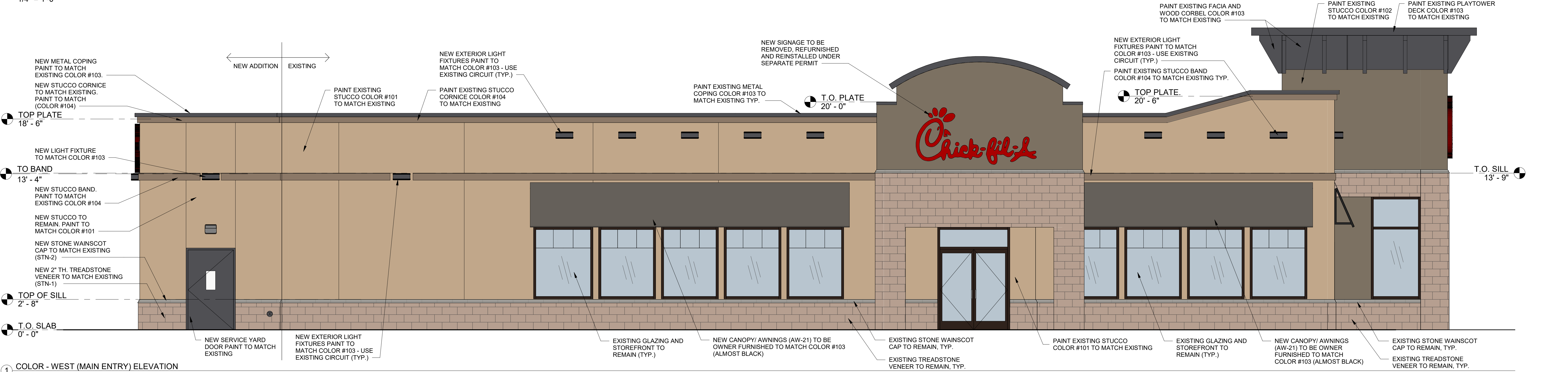
1 COLOR - WEST (MAIN ENTRY) ELEVATION 1/4" = 1'-0"