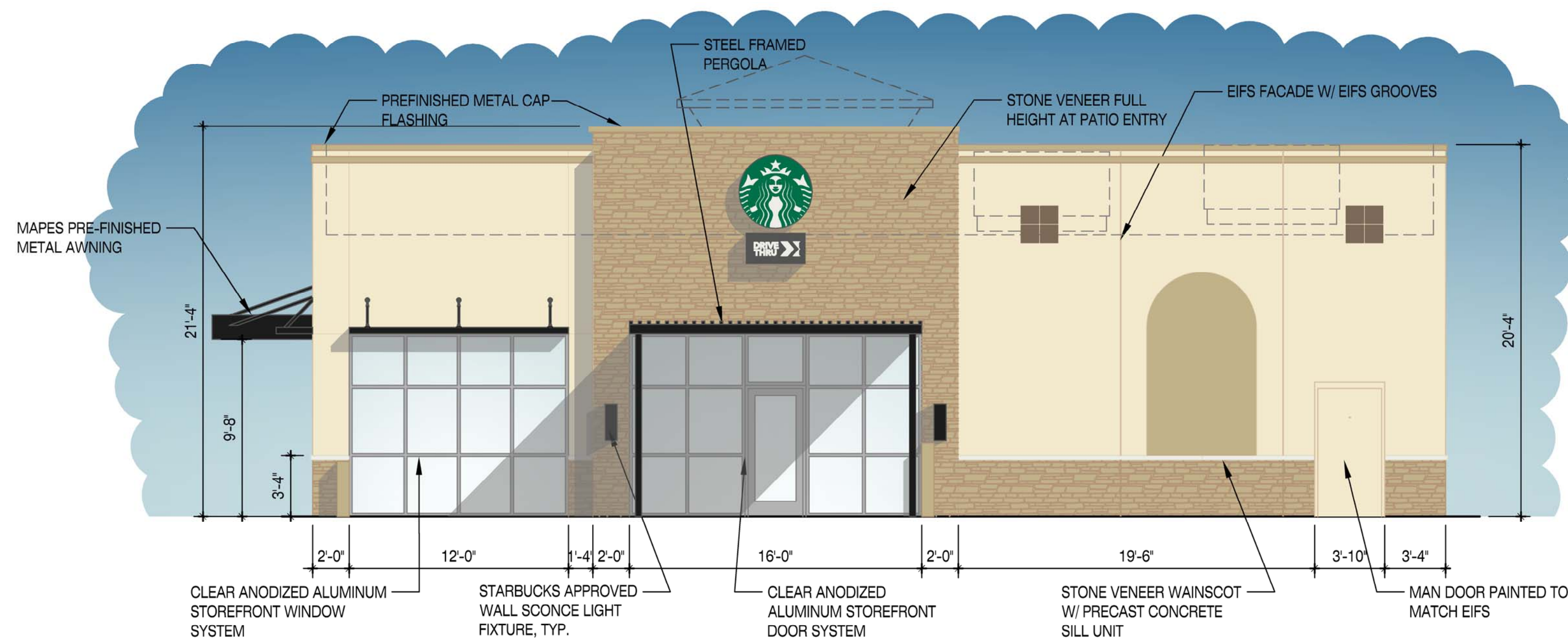
3 ELEVATION SCALE: 3/16"=1'-0" NORTH SIDE