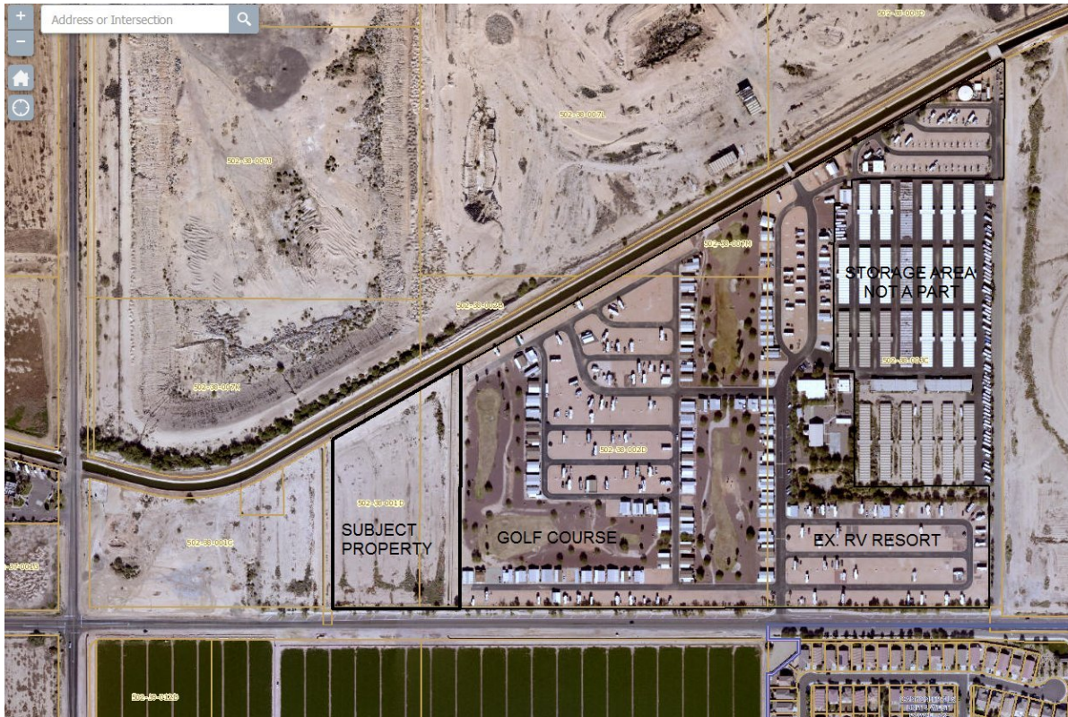
FIGURE 2 - AERIAL MAP