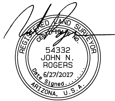
Exhibit map attached and made a part hereof.

THENCE South 36 deg. 40 min. 06 sec. East departing said East right-of-way line, a distance of 300.21 feet to the POINT OF BEGINNING, containing 21,802 square feet or 0.501 acres of land, more or less.