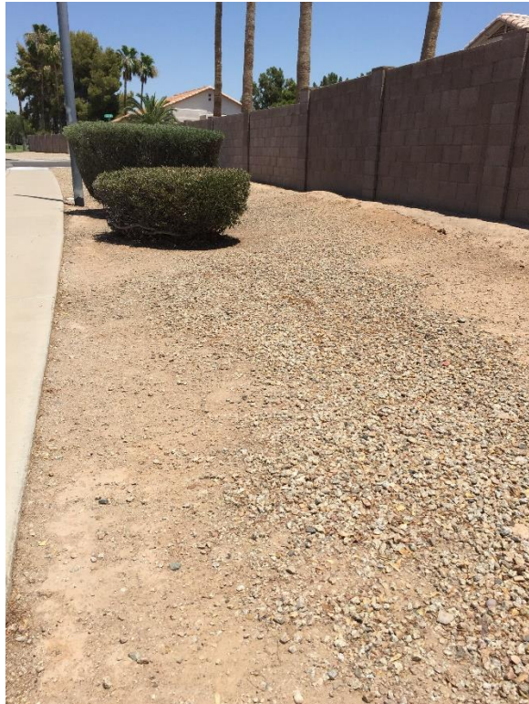
Lower Buckeye Pkwy