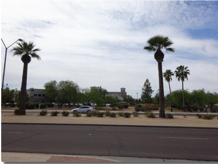
EXISTING VIEW 2 LOOKING SOUTH

YOUNG DESIGN CORP. - 10245 E. VIA LINDA, STE. 211 - SCOTTSDALE, AZ 85258 - (480) 451-9609