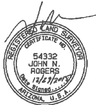
Exhibit map attached and made a part hereof.

THENCE North 89 deg. 44 min. 52 sec. West along said North terminus line, a distance of 9.00 feet to the POINT OF BEGINNING, containing 12,241 square feet or 0.281 acres of land, more or less.