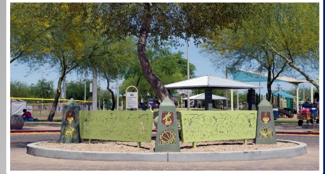
Goodyear Community Park