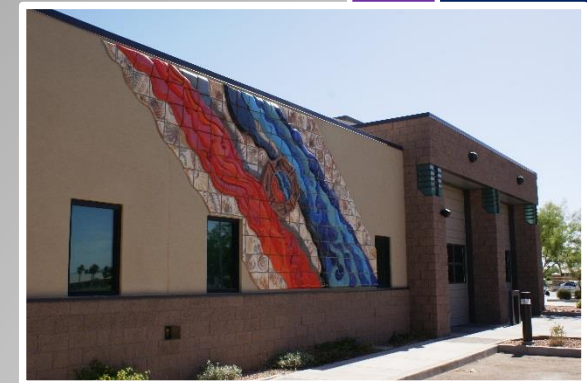
Fire Station 185