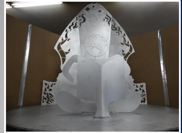
G37 Book Return