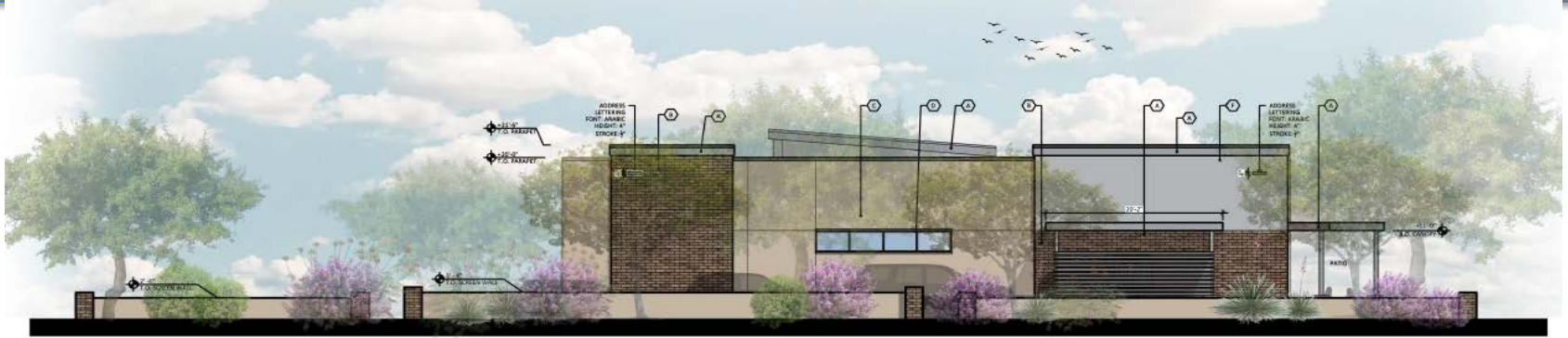
N. ESTRELLA PKWY. ELEVATION