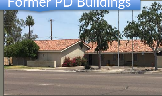
Former PD Buildings