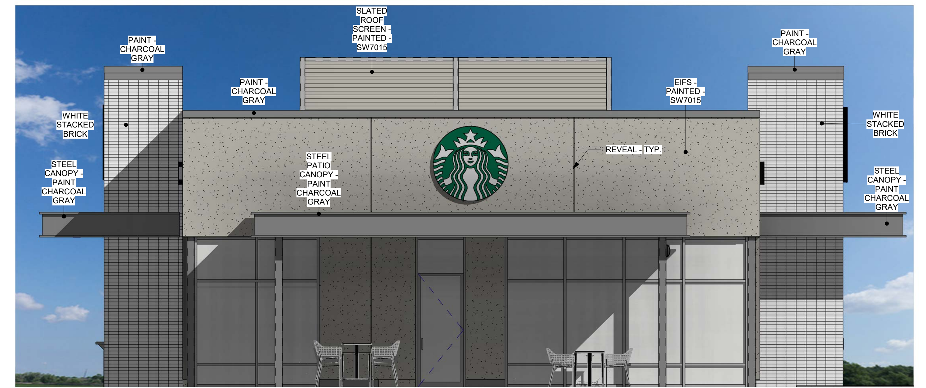
3 WEST ELEVATION