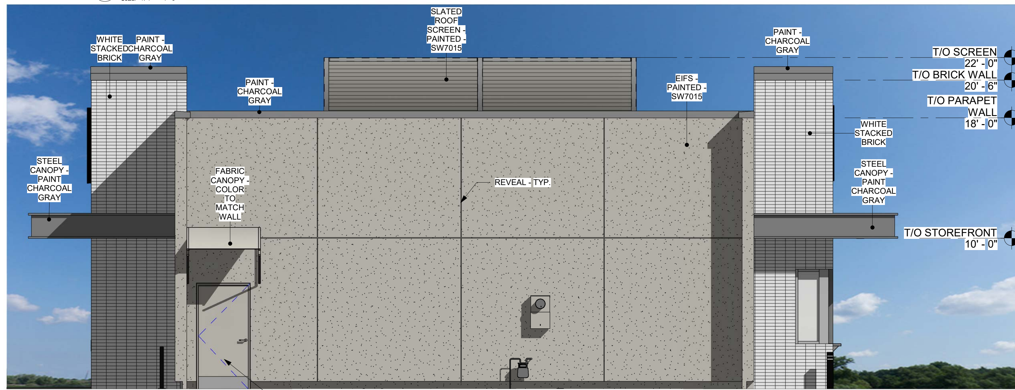
2 EAST ELEVATION