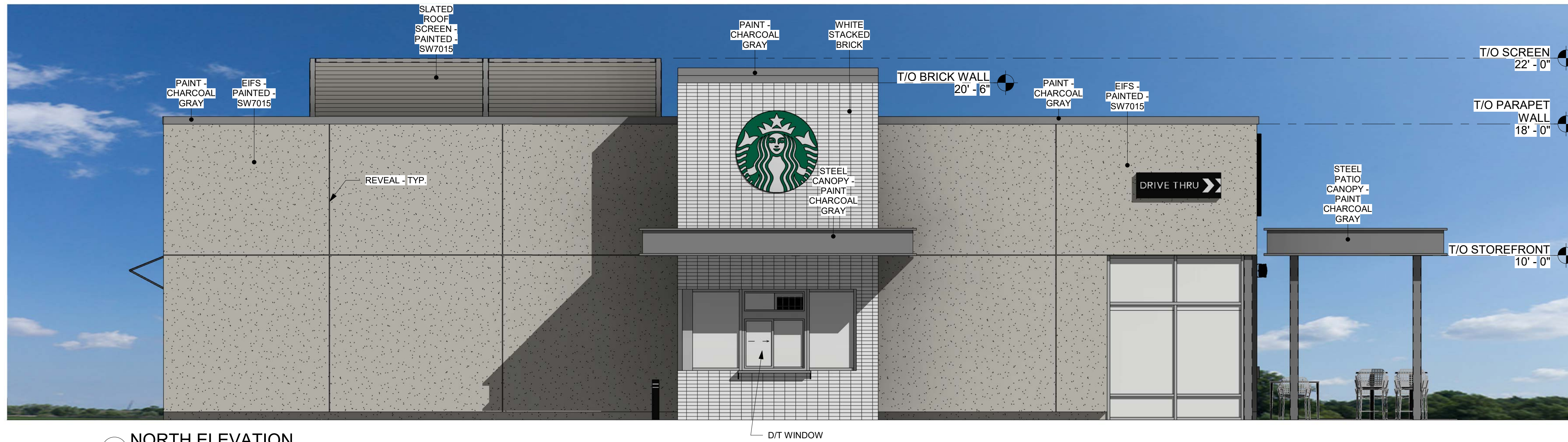
1 NORTH ELEVATION